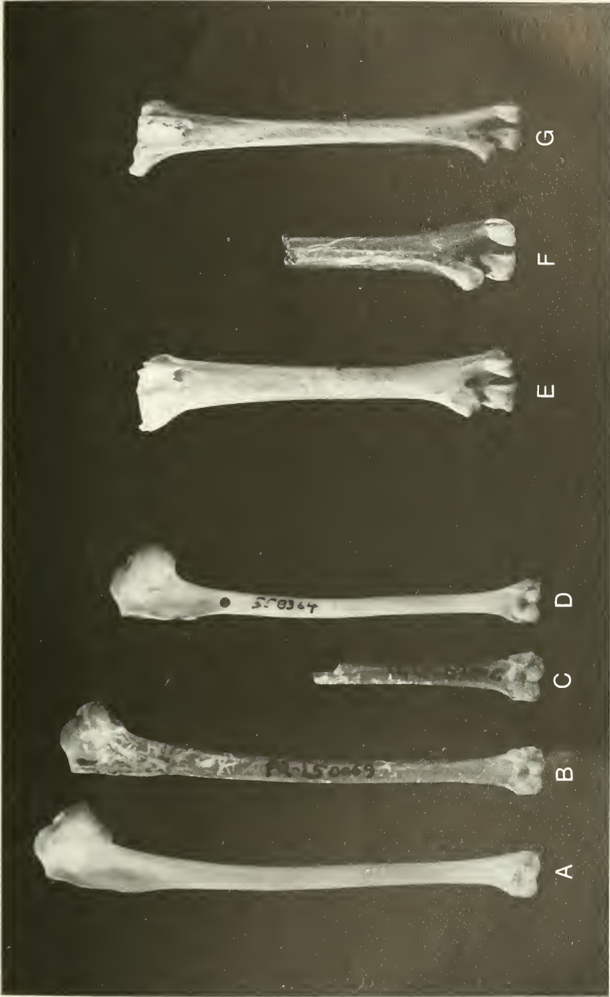
Fig. 2. Fossils of Podiceps? sp. from Langebaanweg compared with Podilymbus podiceps and Podiceps nigricollis gurneyi (USNM 558364). Right humeri in anconal view ( \times 1.5 ). A. P. podiceps (USNM 500858). B. Podiceps? sp., L50069. C. Podiceps? sp., L46678C. D. P. nigricollis . Right tarsometatarsi in posterior view. ( \times 2 ); E. P. podiceps (USNM 610577). F. Podiceps? sp., L50352E. G. P. nigricollis .